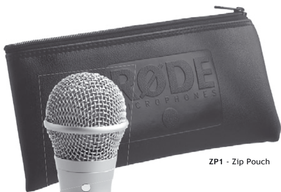
ZP1 - Zip Pouch