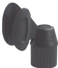
M1 - S1 Microphone Clip